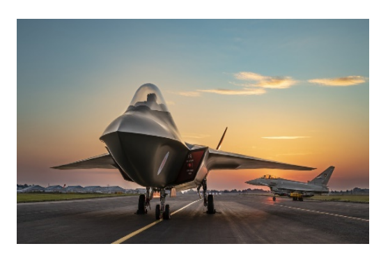
Local Hero Founded 1999